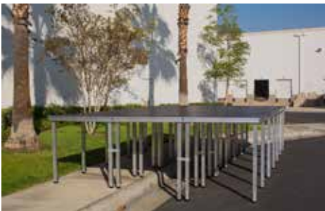
Can be set-up on curbs, slopes, hills, etc.

Super strong and stable! Perfect for dynamic activities such as dancing and jumping!