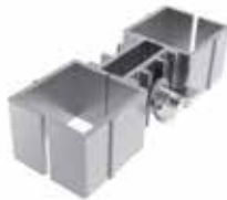
Stage leg clamps are used on all stages set up higher than 32" (80cm) or higher where 2 or 4 stage legs meet. This provides added strength and stability