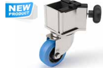
Wheeled leg adaptors fit on stage legs to create mobile stages and drum risers!