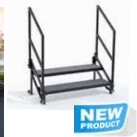
Adjustable and fixed stairs