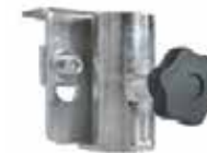
Guardrail/handrail assembly clamp attaches guardrail to stage.