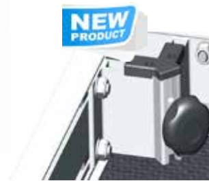
New universal corner adaptors built into the panels allow you to use our square legs cut pipe and use pipe legs