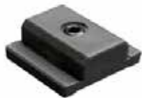
Insert used to level stage panels together