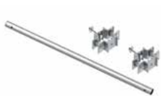
Leg braces (which come with mounting brackets) are recommended to be installed on all stages higher than 36" (90cm) high to provide added stability