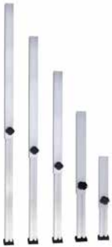
Height adjustable legs